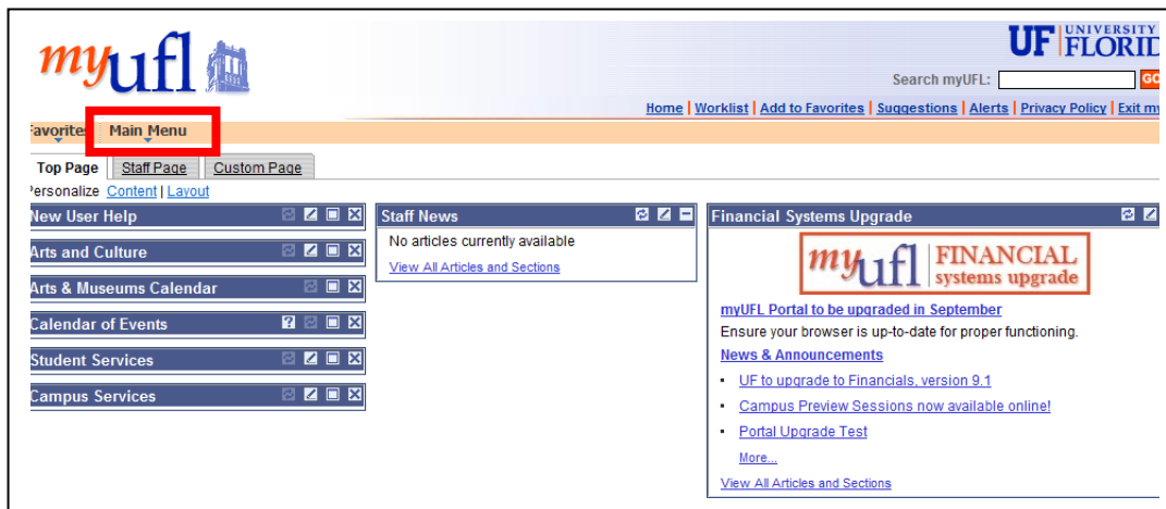
Fig 3. You have reached the myUFL home page. Click Main Menu to see your myUFL options